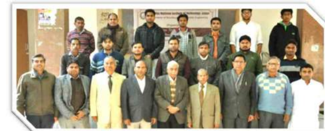
Training program on Basic Metallurgy