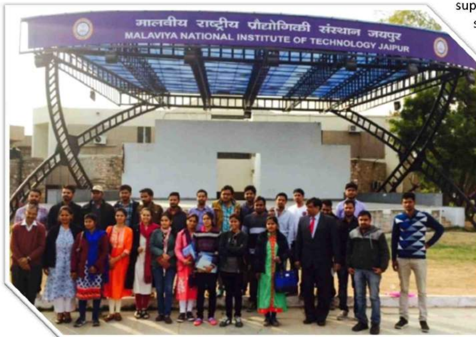
Group photo of 13 th batch of PHED Engineers Training