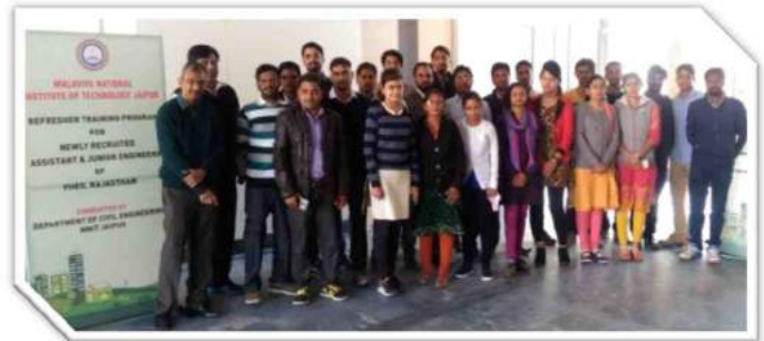
Group photo of 11 th batch of PHED Engineers Training