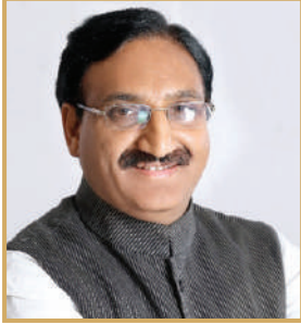
रमेश पोखरियाल 'निशंक' मानव संसाधन विकास मंत्री

स्टार्ट-अप इंडिया भारत सरकार की एक प्रमुख पहल है, जो नवीन आविष्कारों को हाथ में लेने, सहायता और प्रोत्साहनों के वित्त पोषण, उद्योग-शैक्षणिक भागीदारी और इन्क्यूबेटरों के बुनियादी स्तंभों पर आधारित है।