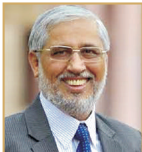
Anil D Sahasrabudhe Chairman, AICTE

I am very happy to see that the detailed guidelines have been issued by Ministry of Human Resource Development on National Innovation and Startup Policy for students and faculties of higher education institutions which further strengthens the Startup Policy released by All India Council of Technical Education in November 2016 from Rashtrapati Bhawan, just after few months of Startup action plan announced by the Government of India in January 2016.