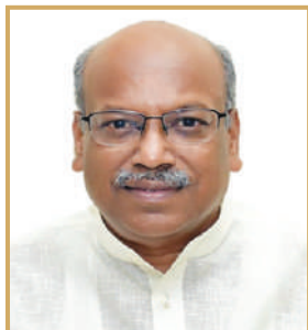
Sanjay Shamrao Dhotre Minister of State for Human Resource Development

India aspires to become a 5 trillion dollar economy in a near future. To reach this mark, it needs to evolve system and mechanisms to convert the present demographic dividend into high quality technical human resource, capable of doing cutting edge research and innovation, and deep-tech entrepreneurship. At this juncture, the MHRD's Innovation Cell and AICTE have brought out the 'National Innovation and Startup Policy 2019' for students and faculty.